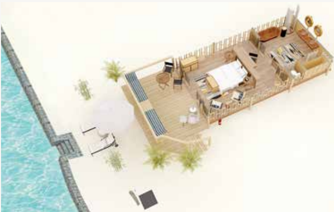
TENTED OCEANFRONT SUITE