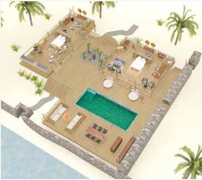
TWO-BED DELUXE POOL VILLA