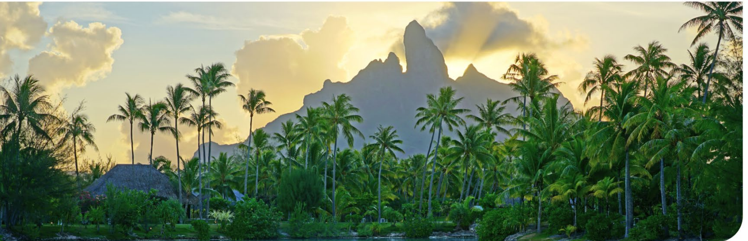
Chart a course beyond the ordinary for your clients with more than 60 new, thoughtfully curated voyages sailing to the world's most captivating destinations from fall 2027 into spring 2028. From the sun-drenched Caribbean on Anguilla and

Norman Island to the remote beauty of the South Pacific and the undeniable allure of Asia, these are voyages to intimate ports with added overnight stays that invite discovery and connection at their own pace.