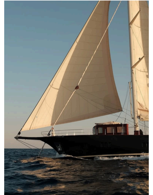
Cruises, yachts, and expedition travel