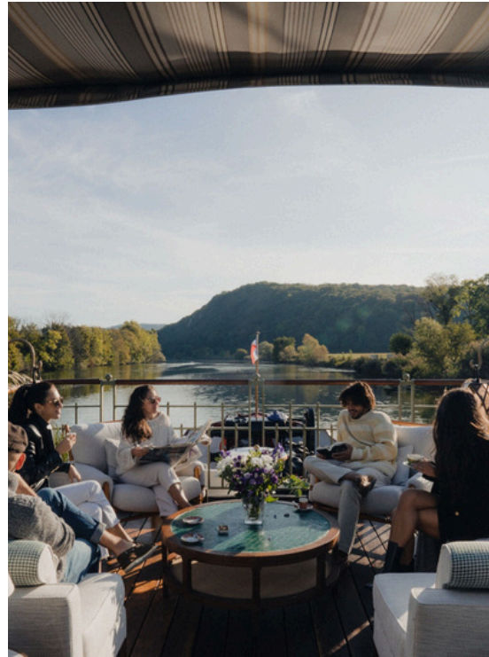
Family travel and multigenerational trips