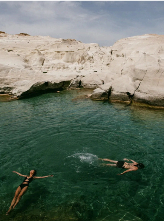
Honeymoons and romantic escapes

Leisure journeys are designed and managed with a deep understanding of each client's travel style, including: