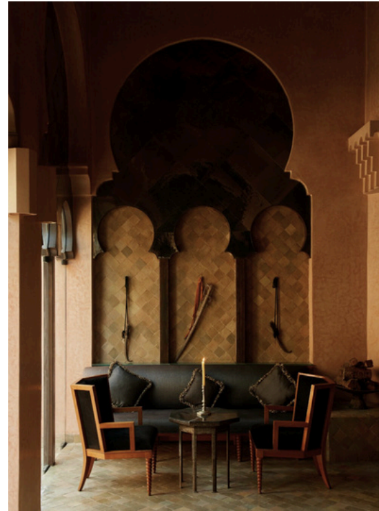
Luxury hotels, resorts, and private villas