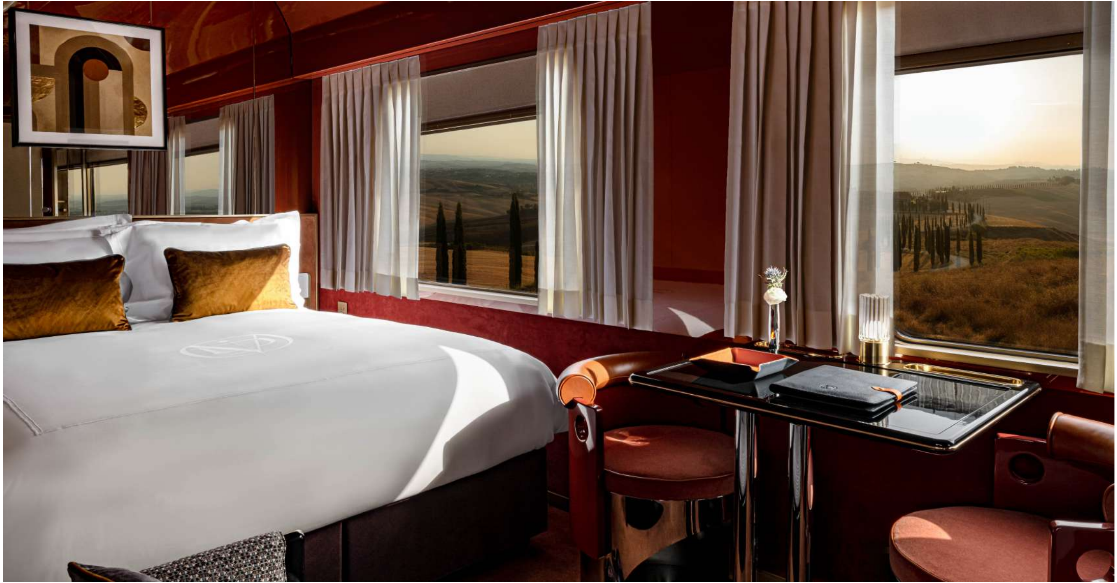
THE SUITE CABINS