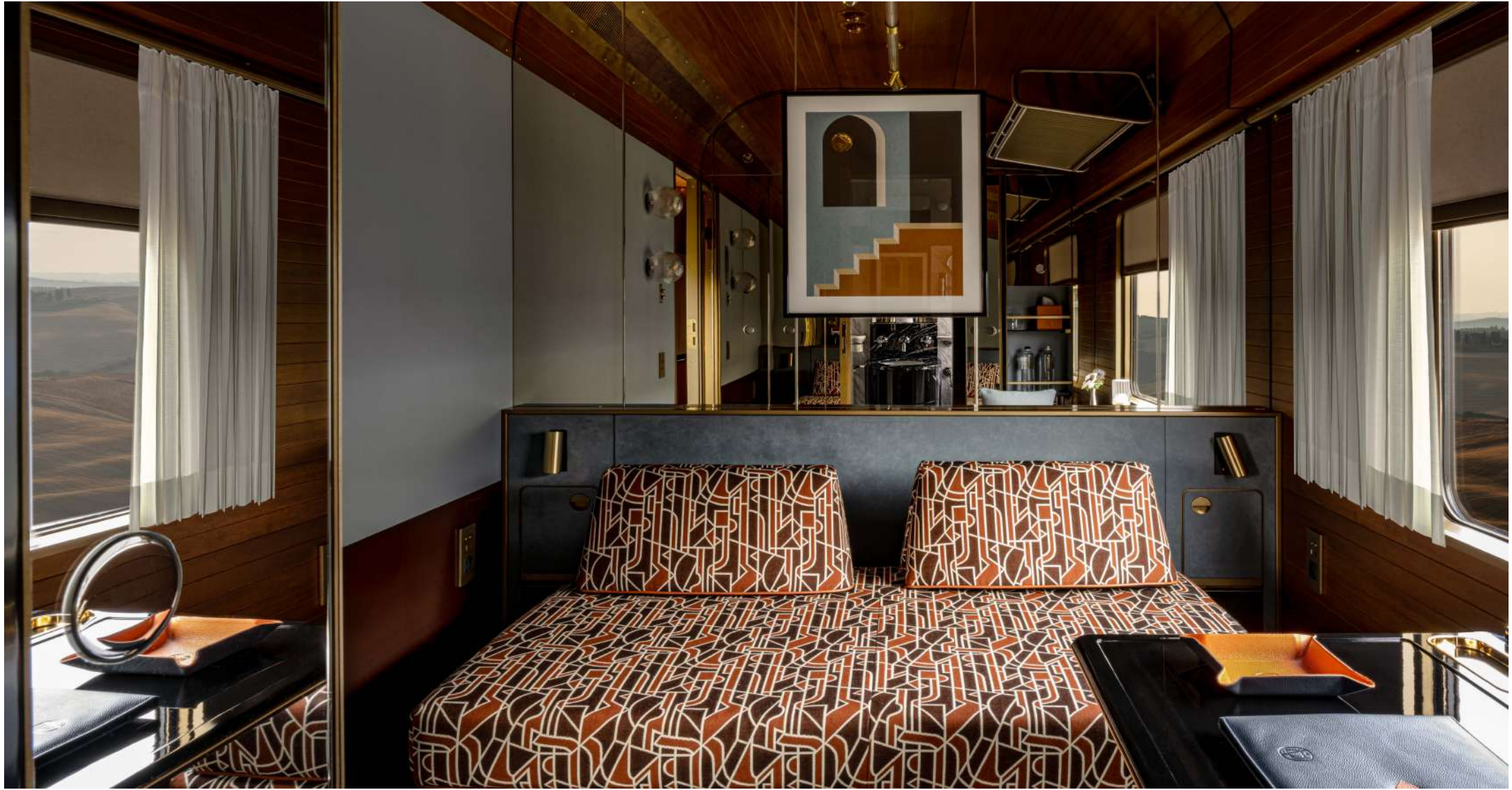
THE DELUXE CABINS