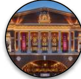
Baltimore, MD The Sagamore Pendry OPEN JANUARY 2025