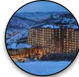
Deer Valley, UT The St. Regis Deer Valley OPEN - POP-UP SHOP NOVEMBER 2023