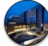
Minneapolis, MN JW Marriott Mall of America OPEN MAY 2024