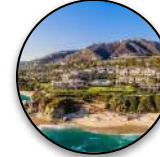
Laguna Beach, CA Montage Laguna Beach OPEN JANUARY 2025