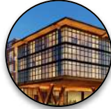
Fort Worth, TX Bowie House, Auberge OPEN JULY 2024