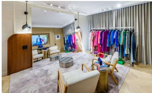
THE FIFTH AVENUE CLUB NASHVILLE