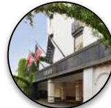
West Hollywood The London West Hollywood OPEN JANUARY 2025