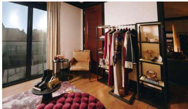
THE FIFTH AVENUE CLUB BALTIMORE