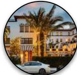
Palm Beach, FL The White Elephant OPENING FALL 2025 Contract Pending