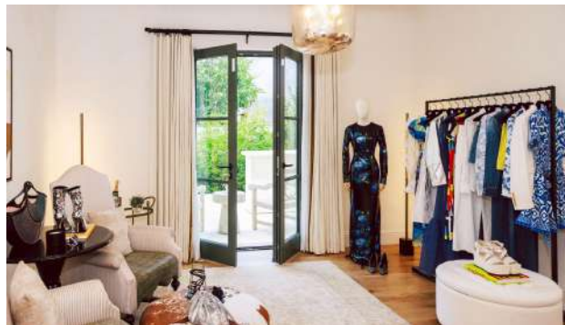
THE FIFTH AVENUE CLUB AUSTIN