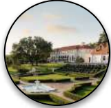
Austin, TX Commodore Perry Estate, Auberge OPEN JULY 2024