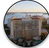
Sarasota, FL The Ritz-Carlton, Sarasota OPEN NOVEMBER 2024