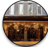
Charleston, SC The Dewberry OPEN NOVEMBER 2023