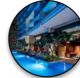
Honolulu, HI The Ritz-Carlton Residences, Waikiki OPEN MAY 2024