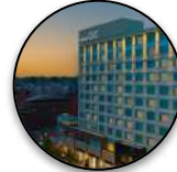
Denver, CO Hotel Clio, Luxury Collection OPEN APRIL 2024