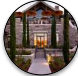
Palo Alto, CA Rosewood Sand Hill OPEN NOVEMBER 2023