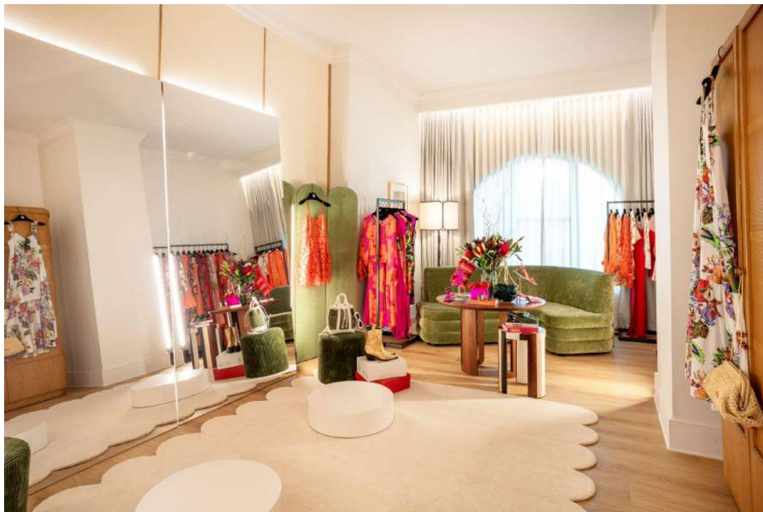
THE FIFTH AVENUE CLUB SAVANNAH