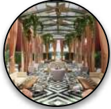
Savannah, GA Hotel Bardo OPEN JUNE 2024