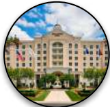
Charlotte, NC The Ballantyne OPENING SPRING 2025 Contract Signed