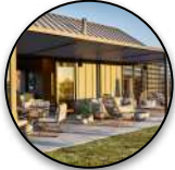
Napa Valley, CA Stanly Ranch, Auberge OPEN JUNE 2023