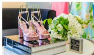
Now, Saks members can partake in (immersive) private buying experiences across all luxury hotels and resorts across the United States.