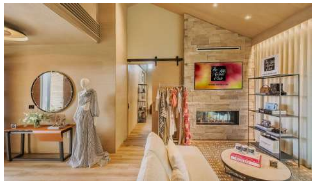
THE FIFTH AVENUE CLUB NAPA VALLEY