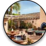
Rancho Santa Fe, CA Rancho Valencia Resort & Spa OPEN SEPTEMBER 2024