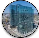
Nashville, TN Conrad Nashville OPEN AUGUST 2023