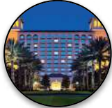
Orlando, FL The Ritz-Carlton Orlando, Grande Lakes OPEN JULY 2023