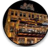
Indianapolis, IN Ironworks Hotel Indy OPEN JULY 2024