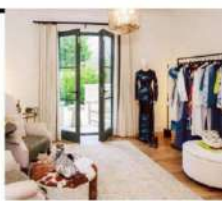
The Austin Fifth Avenue Club in the Commodore Perry Estate, Auberge Resorts Collection.