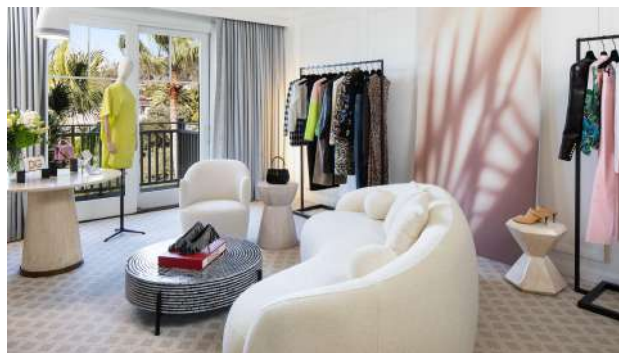
THE FIFTH AVENUE CLUB LAGUNA BEACH