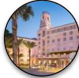
St. Petersburg, FL The Vinoy Resort & Golf Club OPEN AUGUST 2024