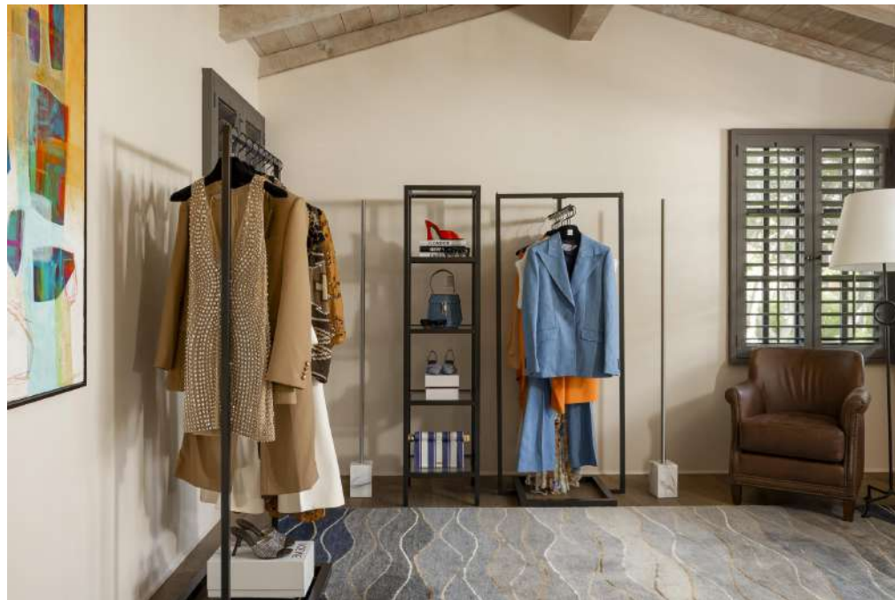
THE FIFTH AVENUE CLUB RANCHO SANTA FE