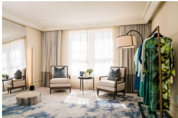
THE FIFTH AVENUE CLUB ST. PETERSBURG