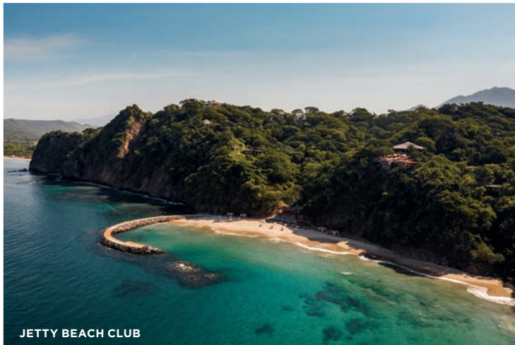
JETTY BEACH CLUB