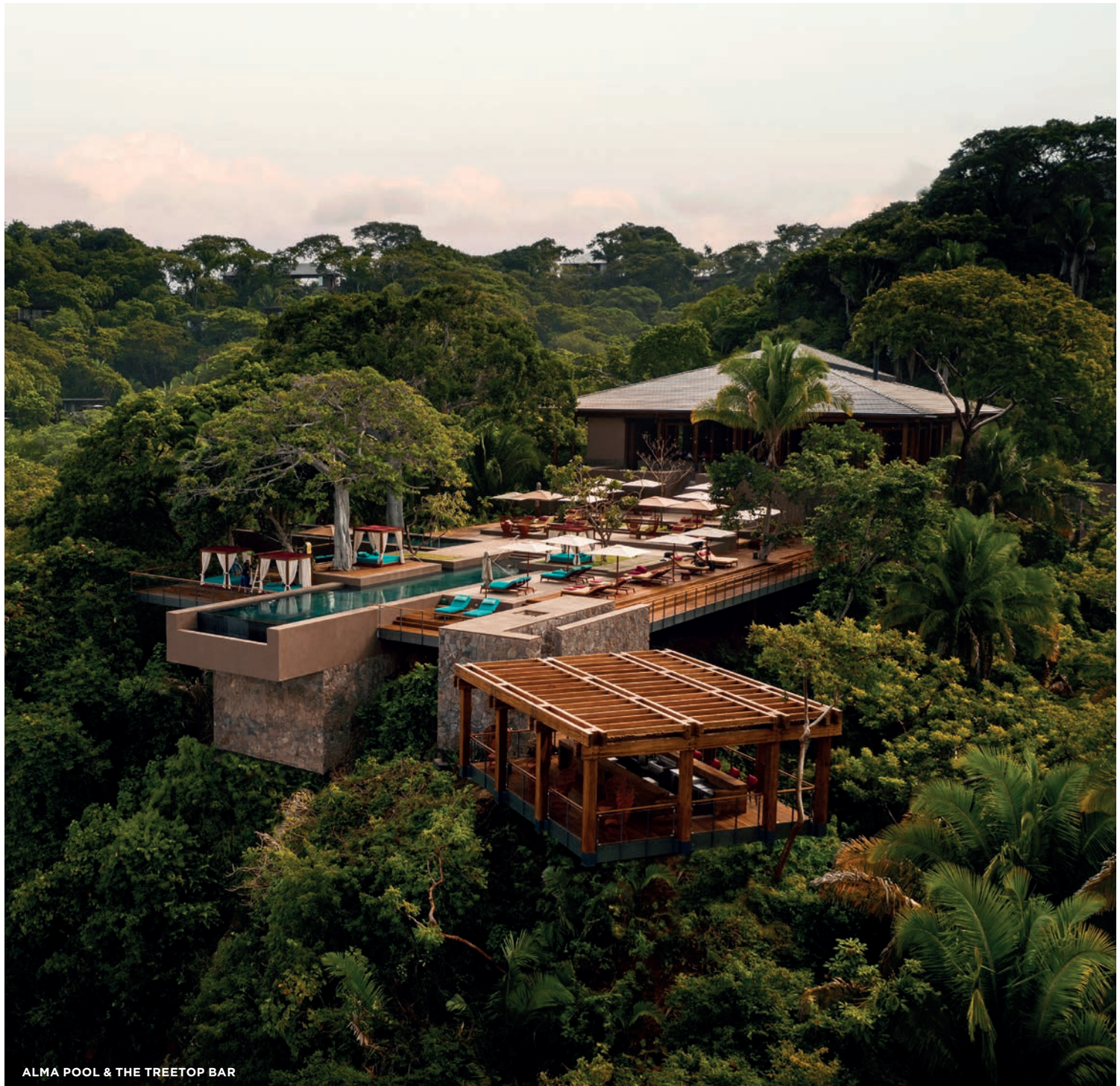
ALMA POOL & THE TREETOP BAR