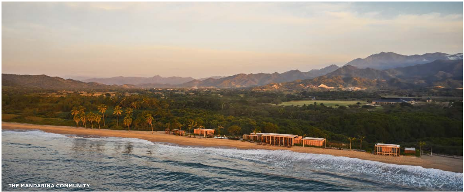
THE MANDARINA COMMUNITY