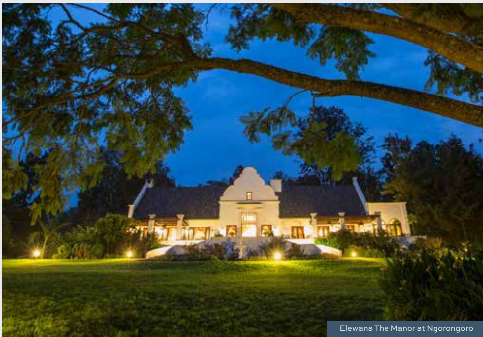
Elewana The Manor at Ngorongoro