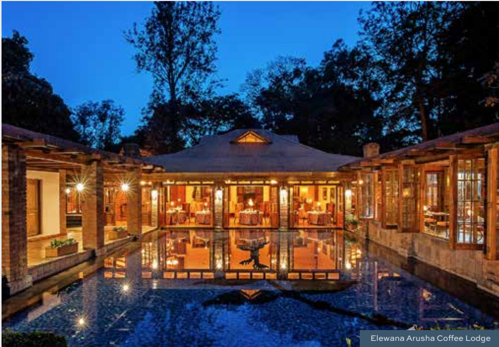
Elewana Arusha Coffee Lodge

Day 1: Elewana Arusha Coffee Lodge for 1 night