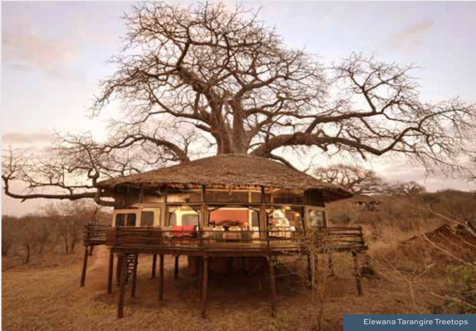
Elewana Tarangire Treetops