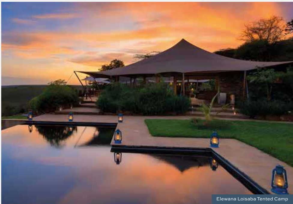
Elewana Loisaba Tented Camp