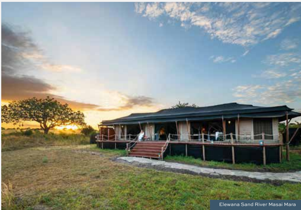
Elewana Sand River Masai Mara