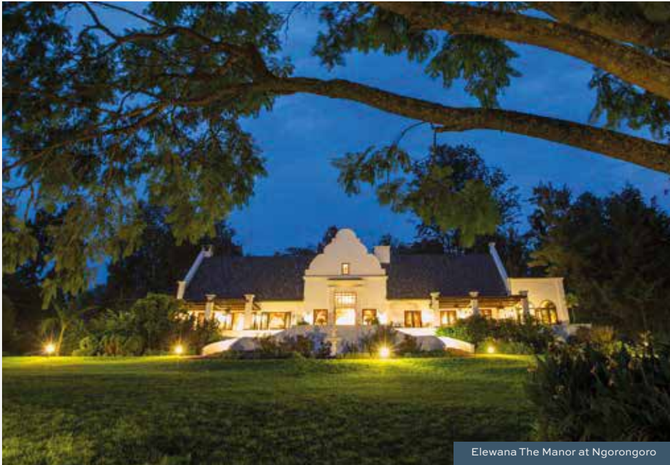
Elewana The Manor at Ngorongoro