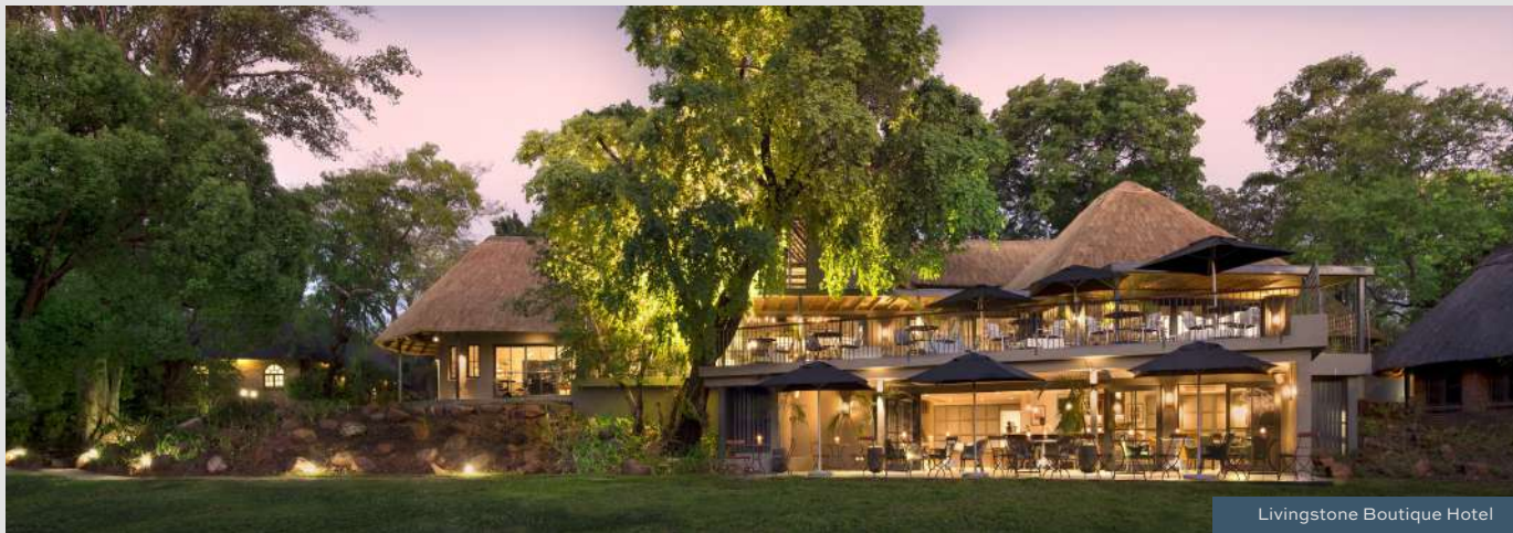
Livingstone Boutique Hotel