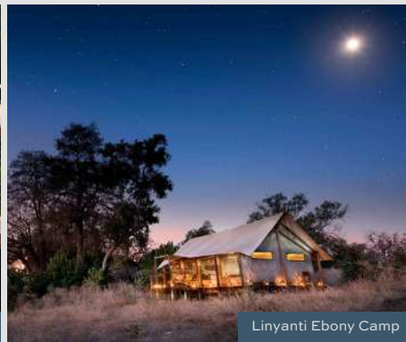
Linyanti Ebony Camp